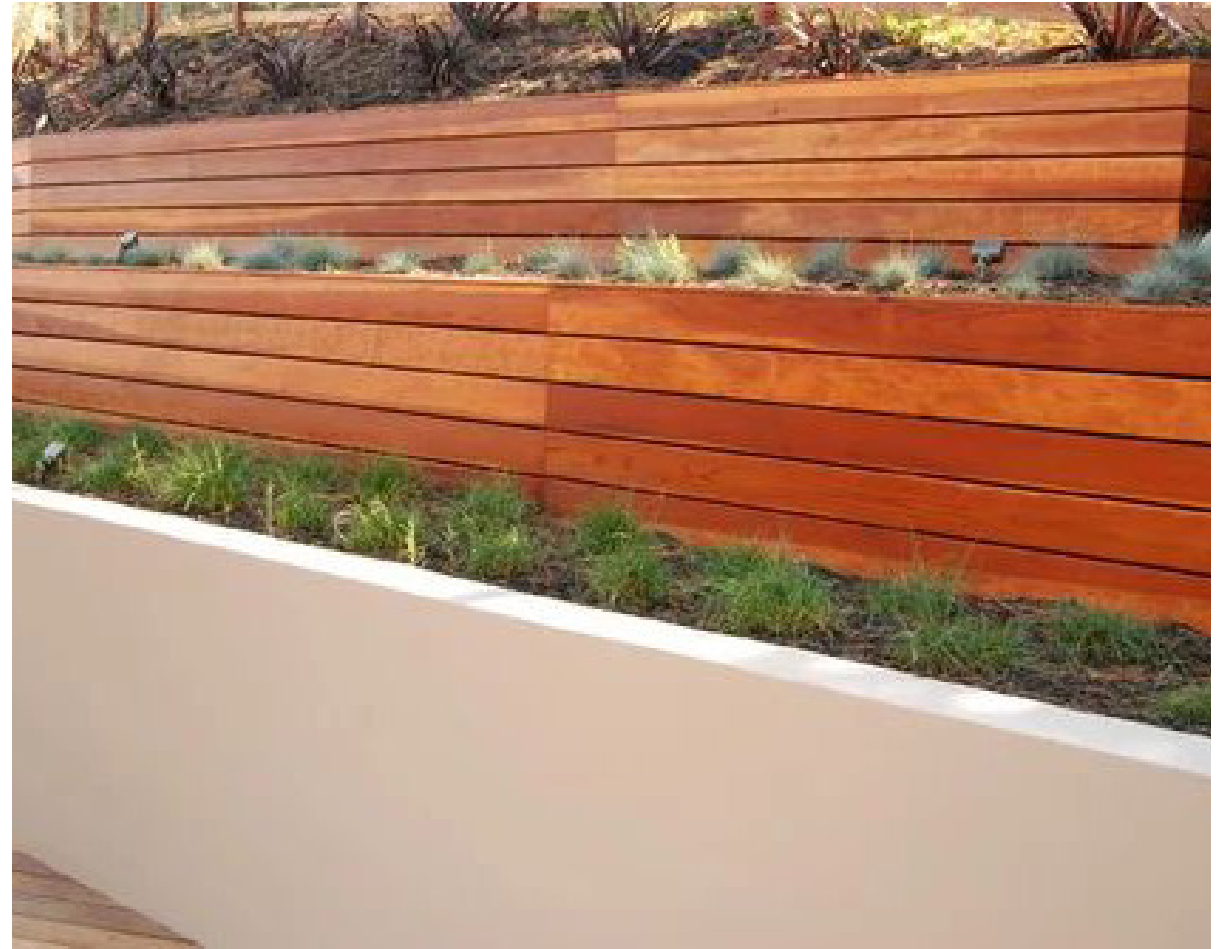
WOOD TERRACE WALLS