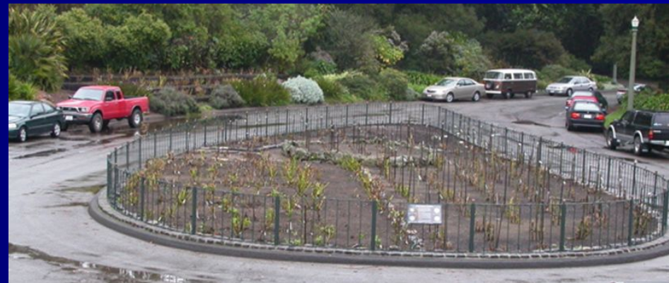
January before we dig out ...