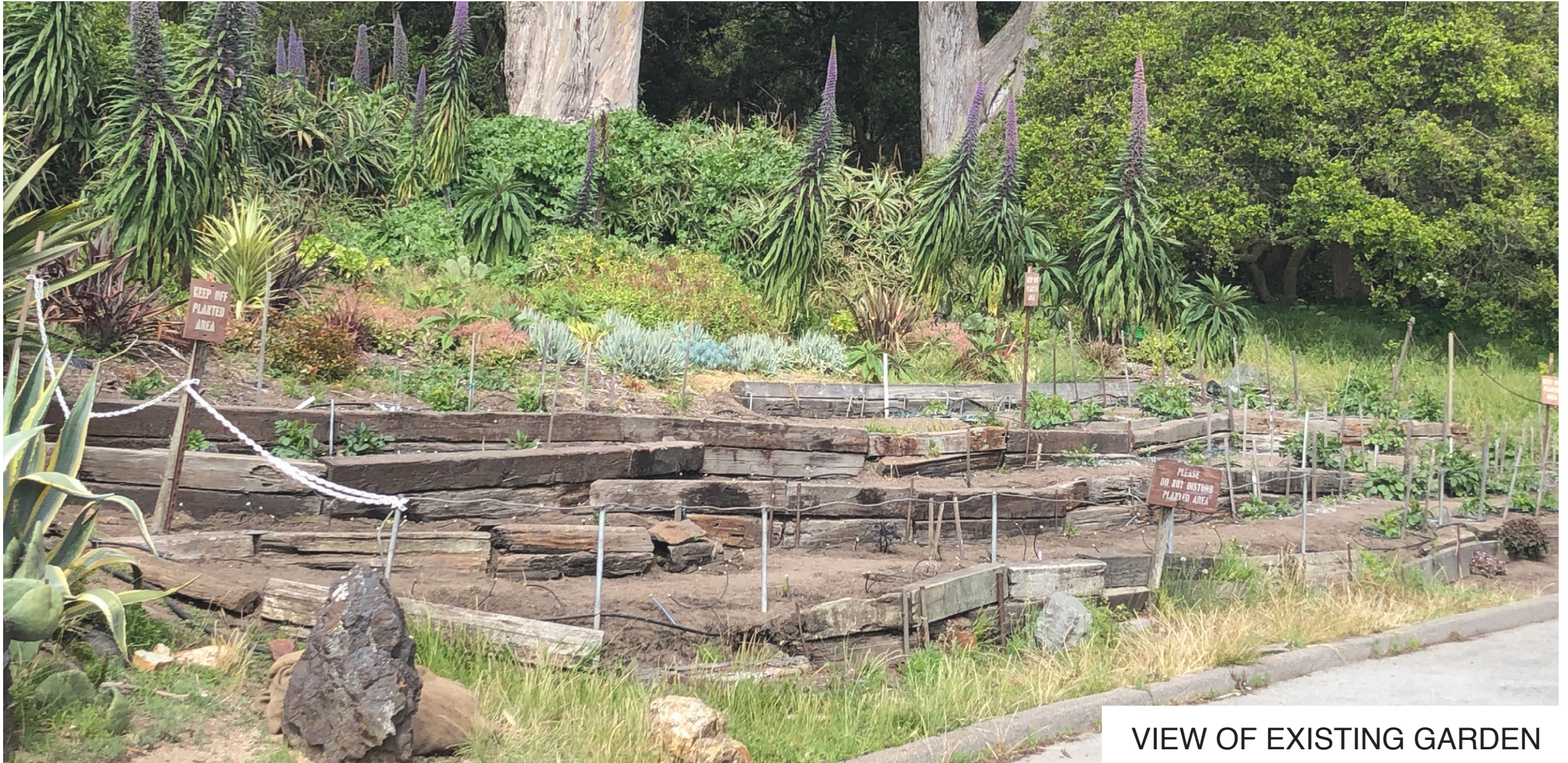
VIEW OF EXISTING GARDEN