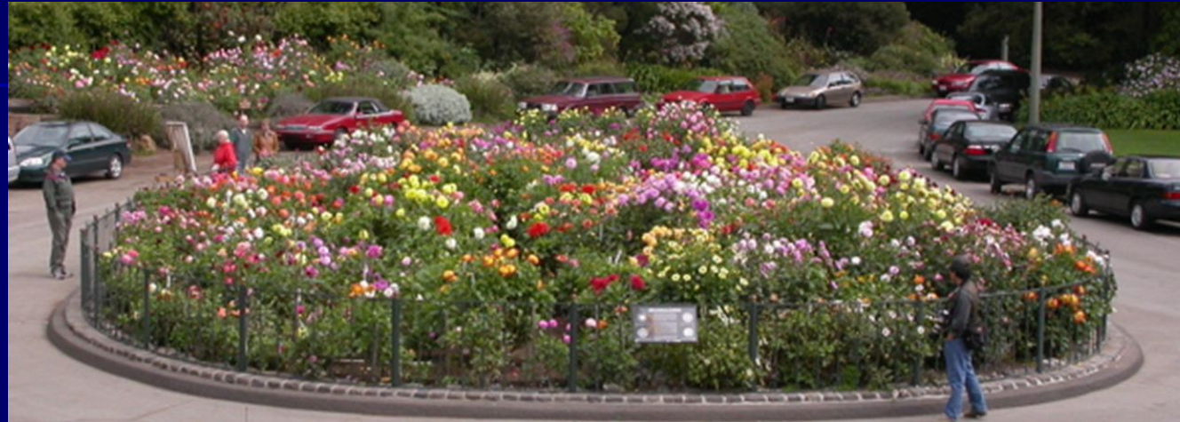
August in full bloom (above)