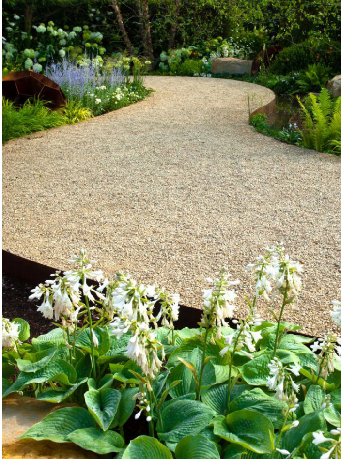
STABILIZED DECOMPOSED GRANITE