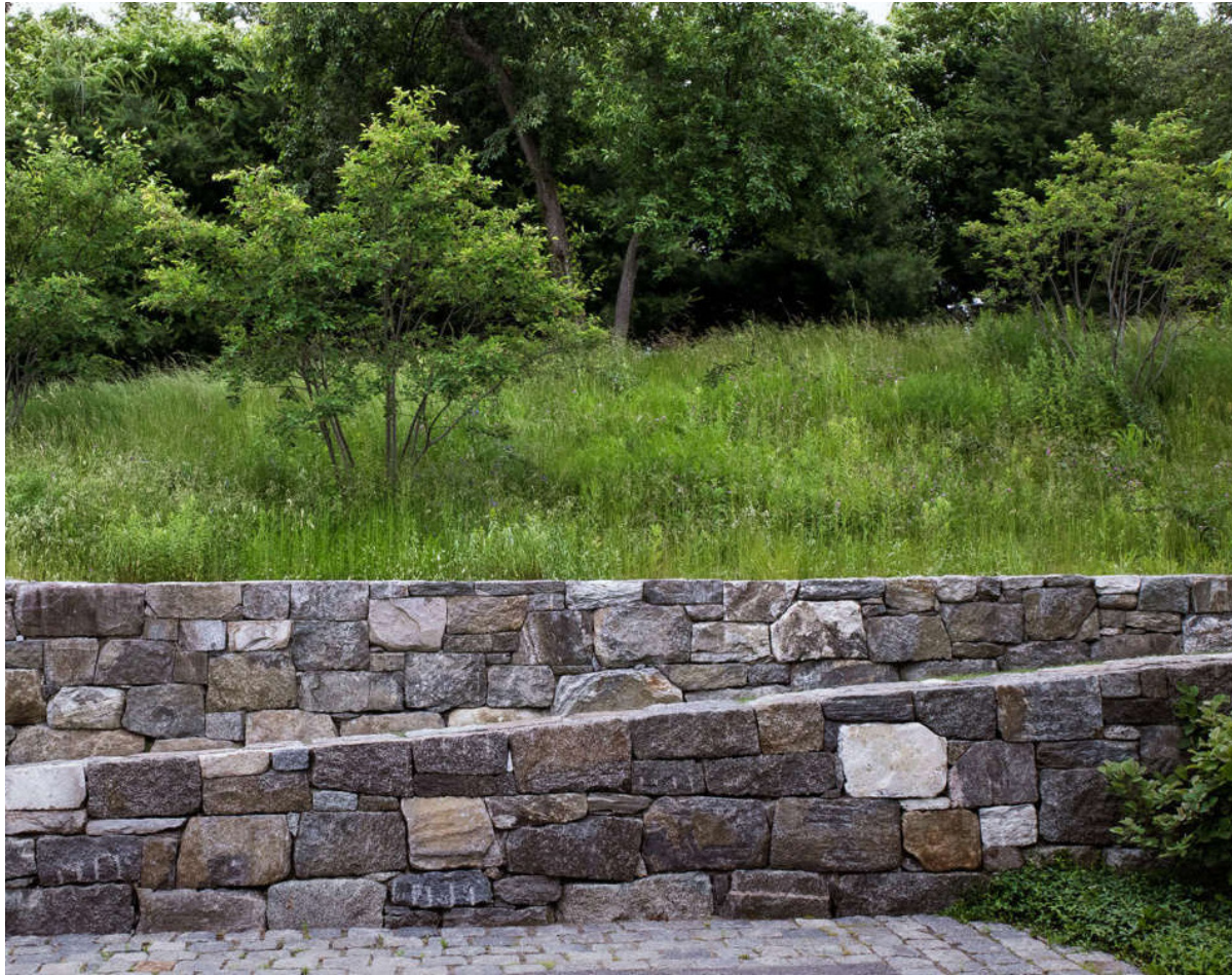
STEPPED STONE WALL