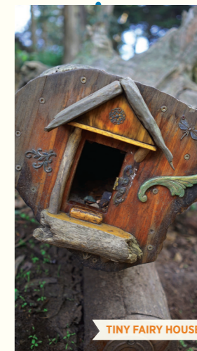
TINY FAIRY HOUSE