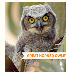
GREAT HORNED OWLET